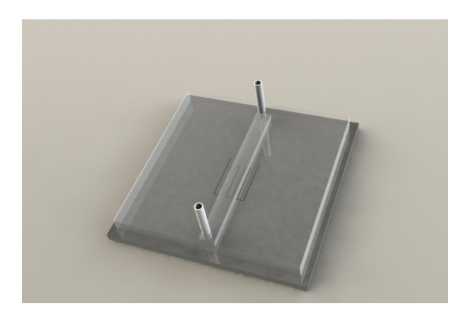
Figure 1: CAD design of device.